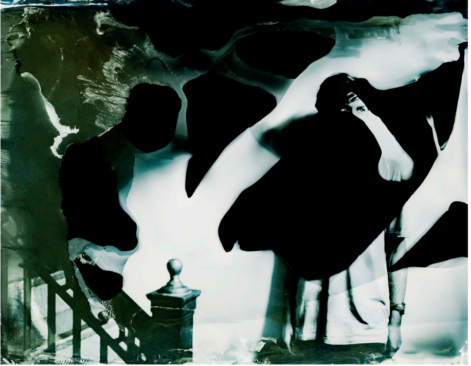
volatile Pamira Yanar