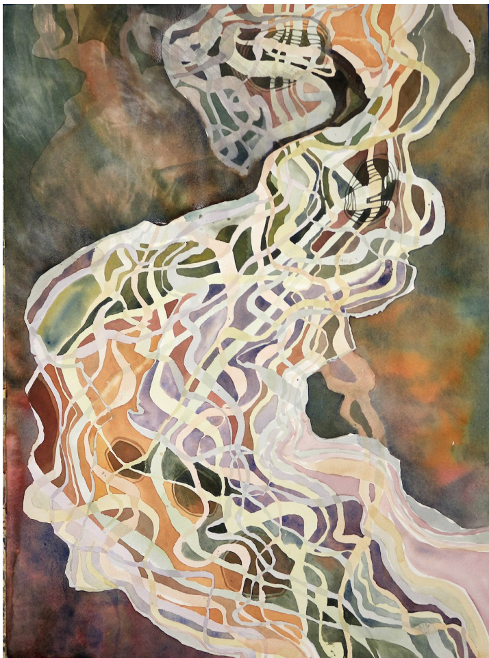
Rockfalls Drive Casey Murano