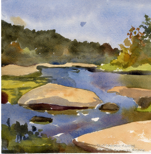
Slow Gallops Casey Murano