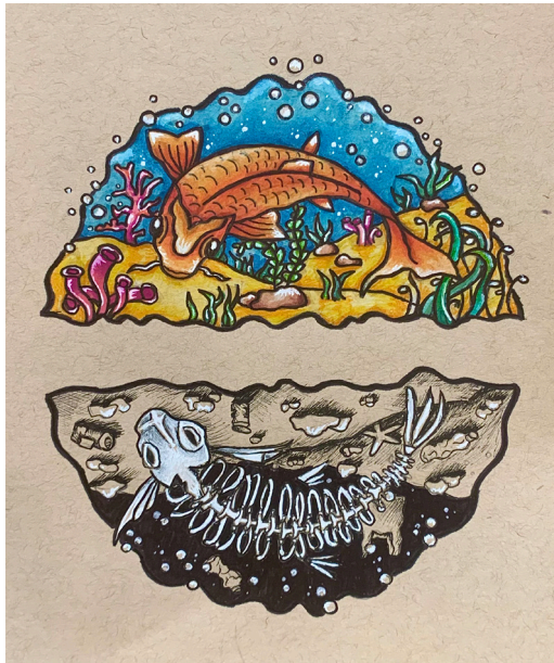
Warped Reflection Nichole Schiff