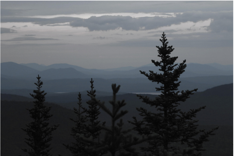
View from Mount Magalloway, NH Nathan Burns