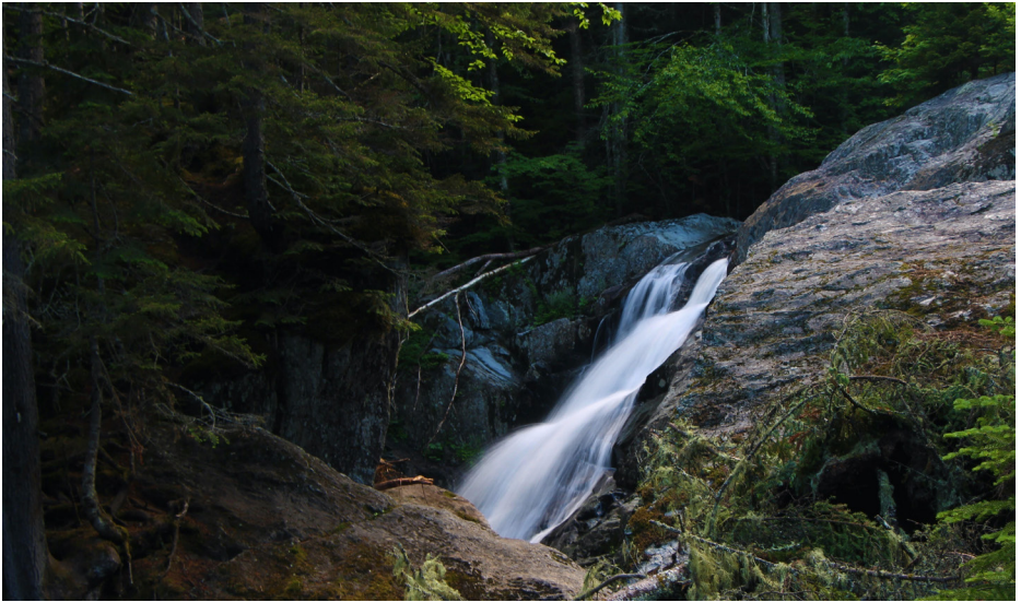
Garfield Falls in the Late Afternoon