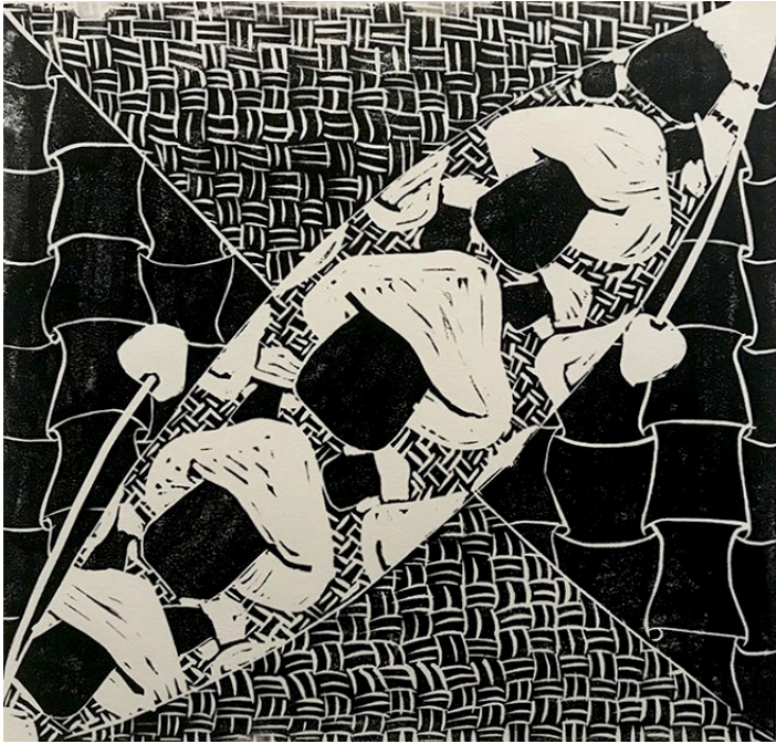
Foraged Gabby Kiser