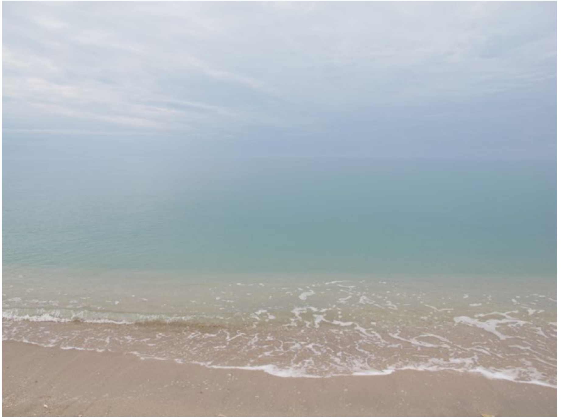
Secret Ocean // Janelle Sadarananda // Photography