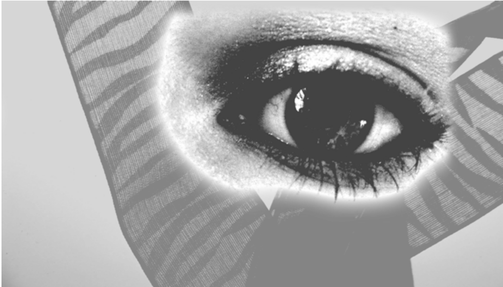
Film still from "Isolation" // Julia Eldred // video http://www.youtube.com/watch?v=cDoU9xY9EsU