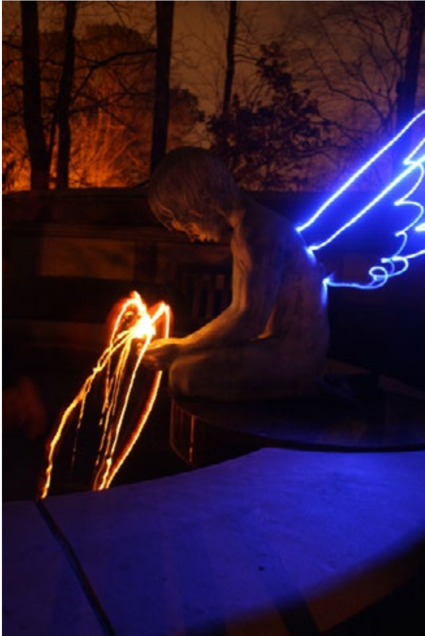
Contemplation // Laura DelPrato // Photography