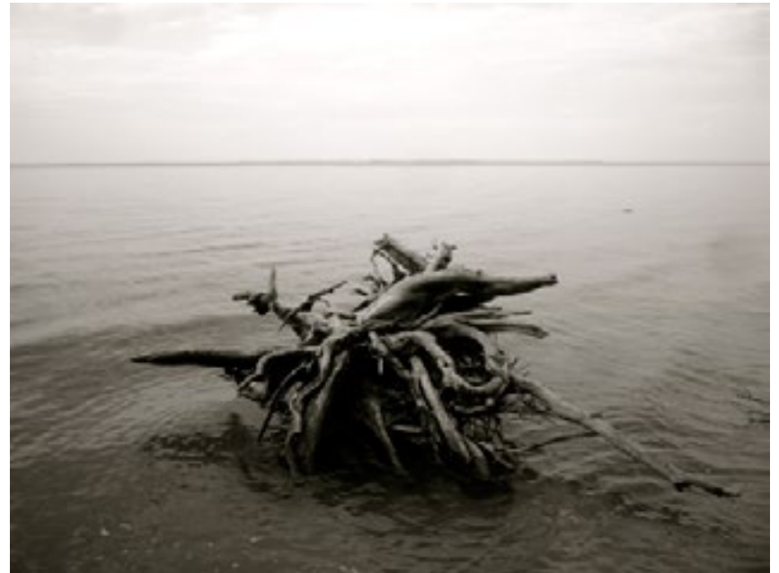
Growth II // Astoria Aviles // Photography