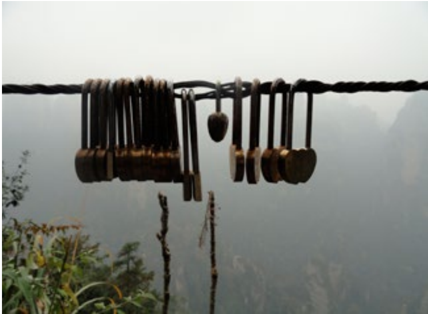
Untitled // Aleah Goldin