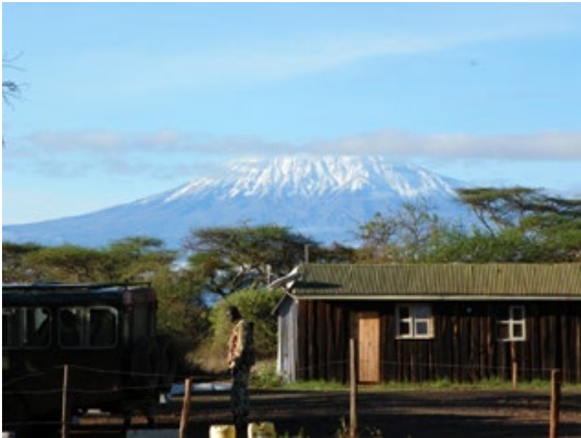
Mount Kili, Kenya // Alyxandra Pikus // Photography