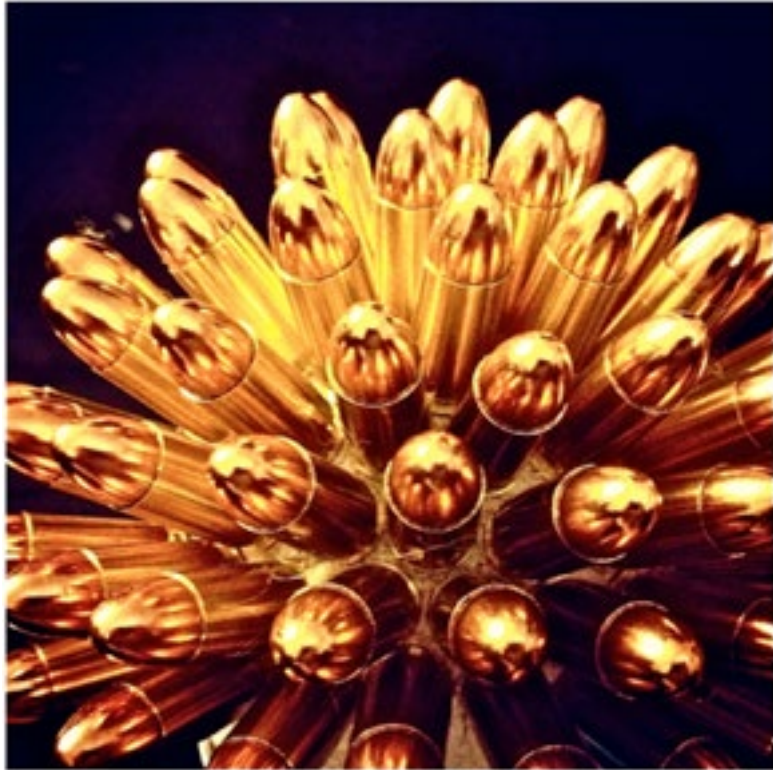
9mm II // Daisy Gould // Sculpture 77