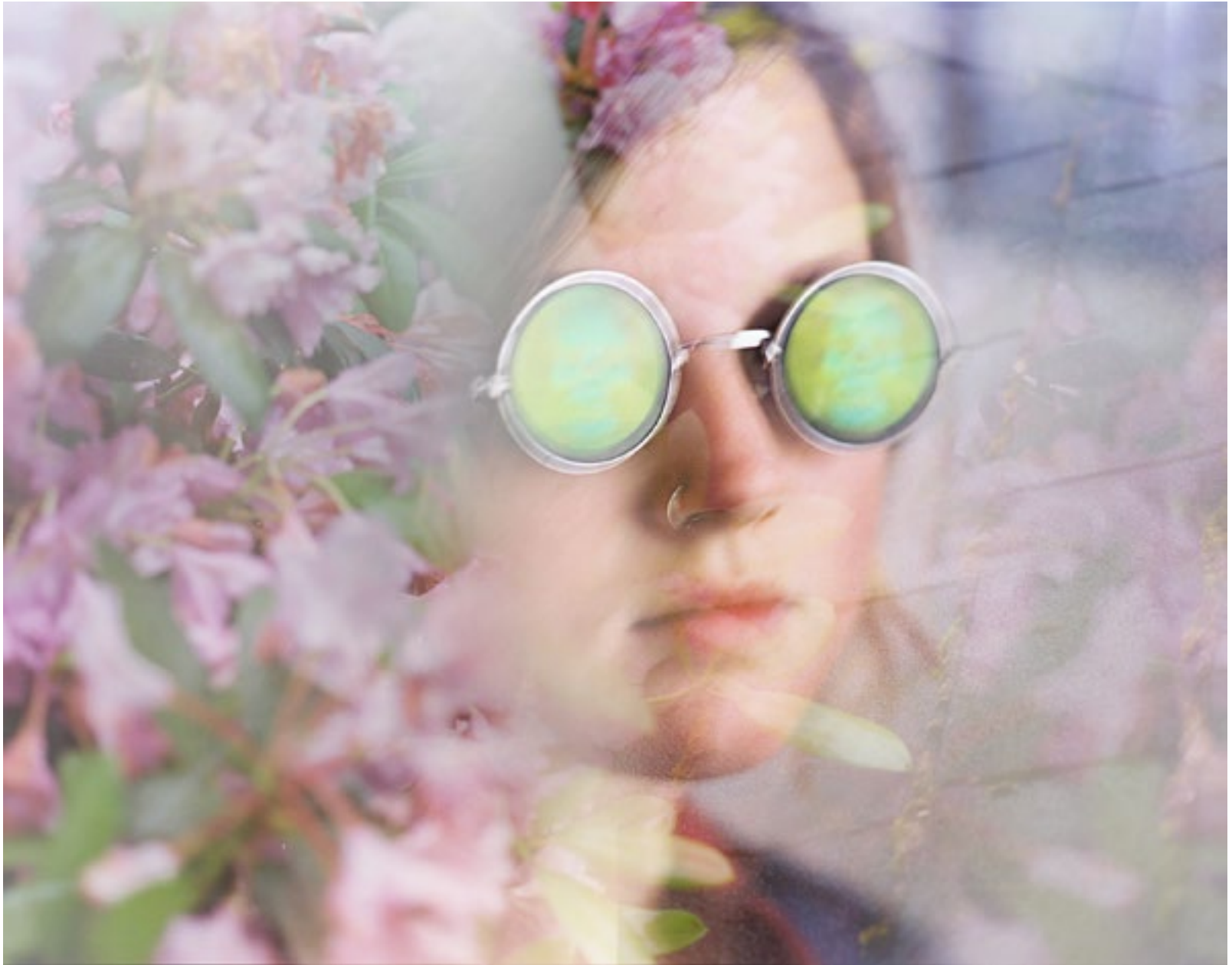
Olivia // Kenta Murakami // Photography