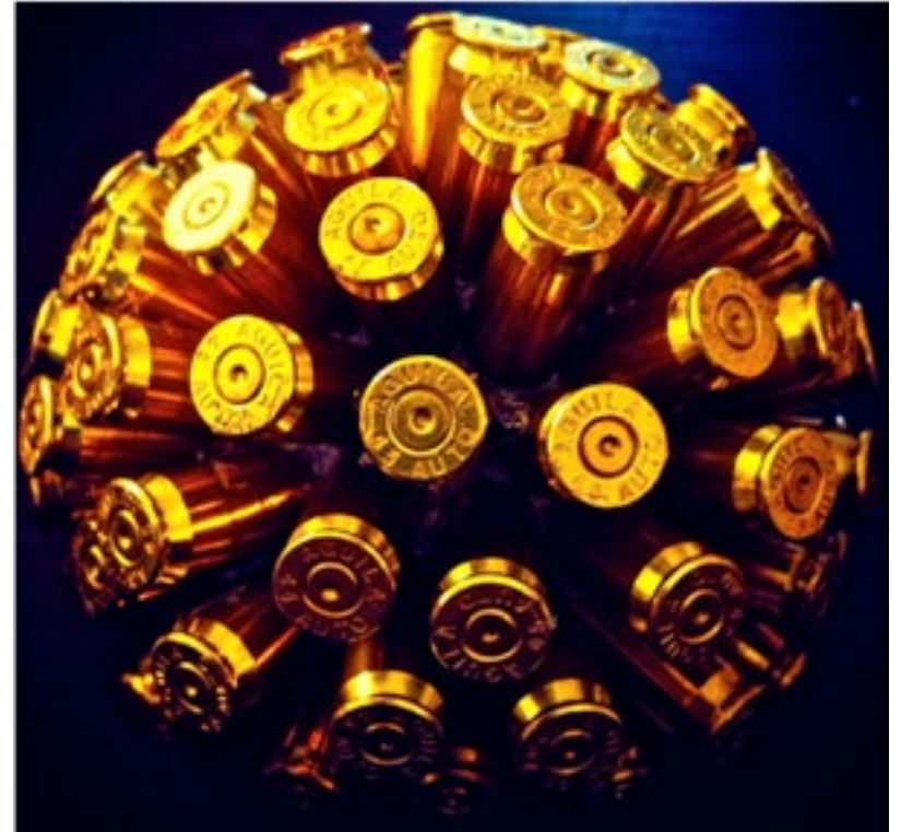
9mm Shell III // Daisy Gould // Sculpture