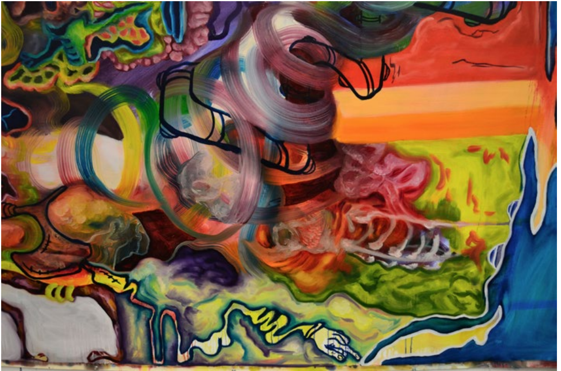
Bubble // Dee Glazer // Oil on Canvas (89"x63")